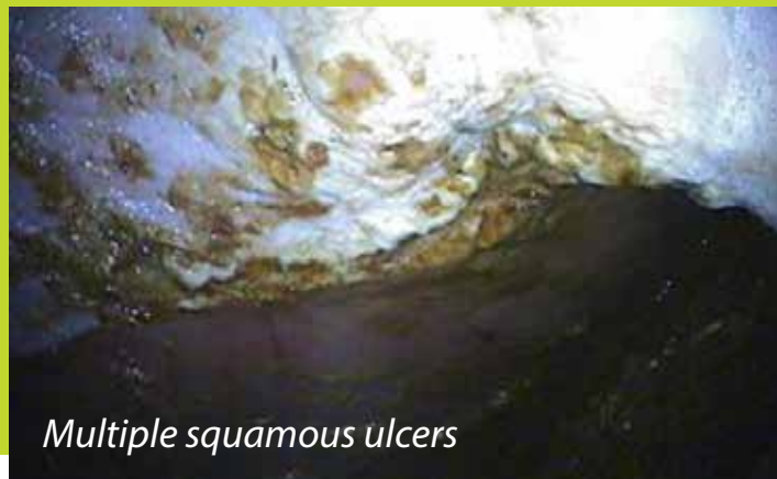
Multiple squamous ulcers